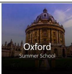
Oxford Summer School