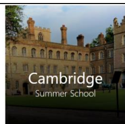
Cambridge Summer School

Immerse Education provides enriching academic and careers programmes for students aged 13-18 from around the World. Our courses give them a taste of university-level study at top institutions like the University of Cambridge, the University of Oxford, UCL . To gain a deeper insight into our programmes, check out the 2024 Prospectus .