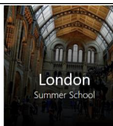
London Summer School

Summer Schools For Students Aged 13-18 | Immerse Education